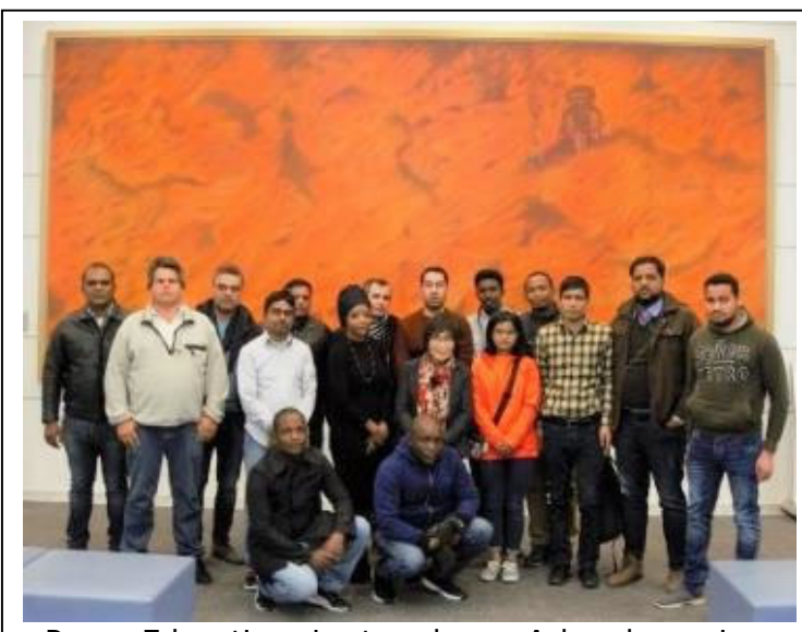
Peace Education: Lecture by an A-bomb survivor

In the next day the first place we visited was Miyajima Island embarked on a high standard safety boat from Miyajima guchi station to Miyajima port then we had a seeing of Miyajima, I enjoyed really beautiful places like the shrines both old and new one in the island. Then at the