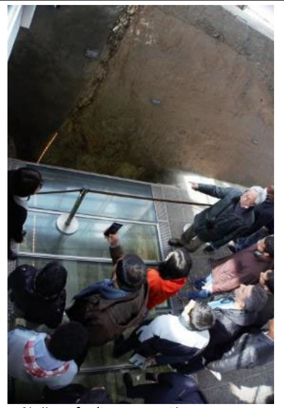
Nojima fault preservation museum

Next morning we headed to Nojima fault around Ezaki Toudai and we observed a real fault and surface displacement, after that we headed to