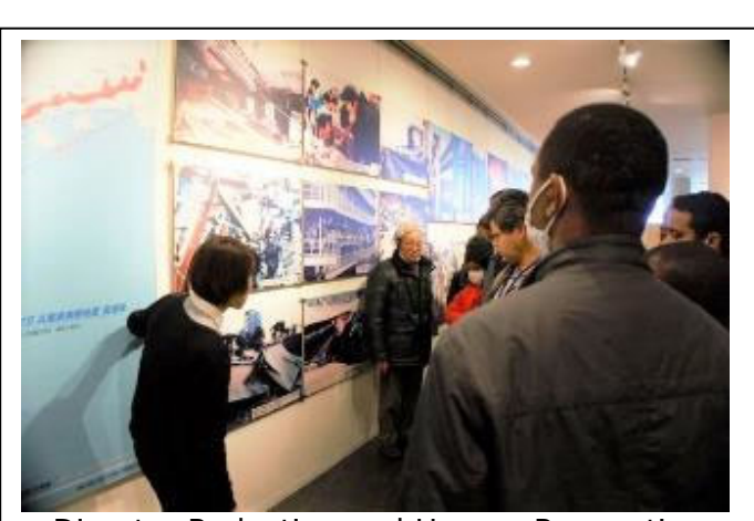
Disaster Reduction and Human Renovation Institution

It was a dream come true for me to pass through Akashi-Kaikyo Bridge (world's largest suspension bridge) for Awaji Island. It was amazing to see a real Nojima fault and experience a simulated earthquake in the Nojima Fault Preservation Museum and also got more knowledge about the "The