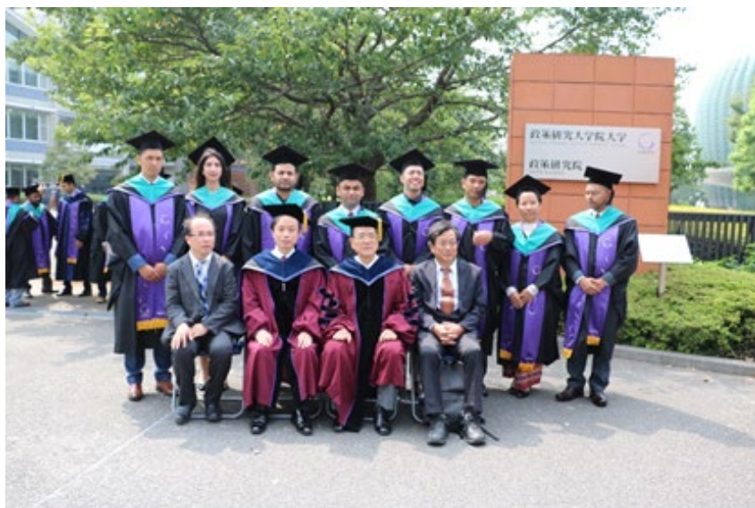
GRIPS Graduation Ceremony