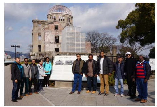
Global Seismological Observation Course