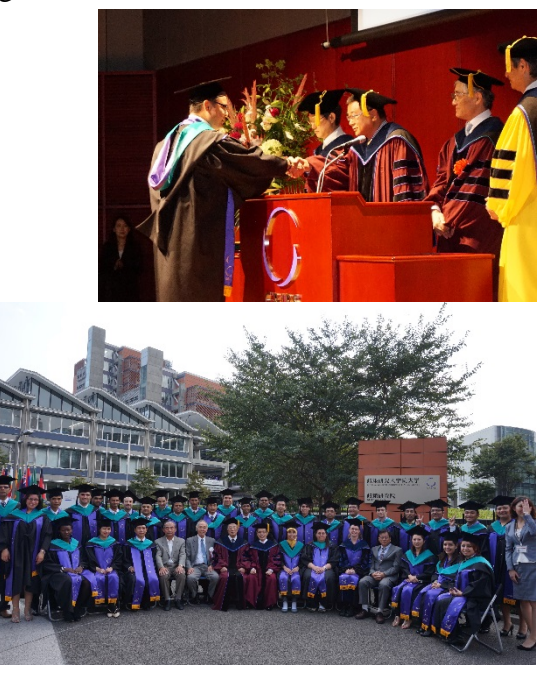
Conferment of a Master's Degree in GRIPS

As of September 2019, 289 graduates are conferred the degrees from 2005.