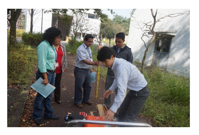
Tsunami Disaster Mitigation Course