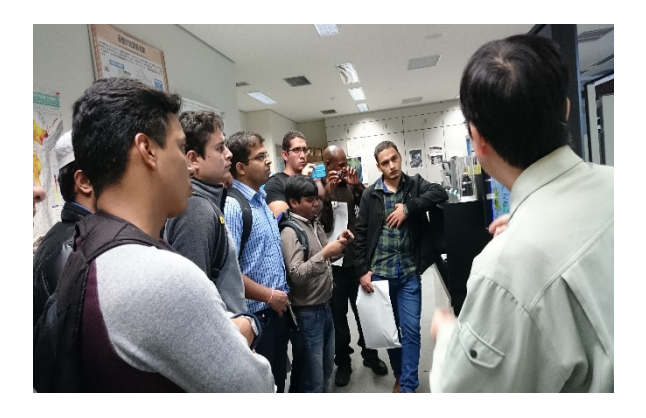
Earthquake Engineering Course